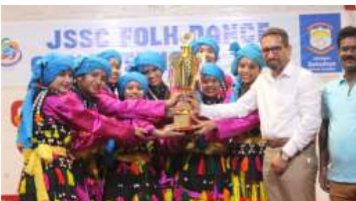
JSSC Folk Dance Competition-Winner