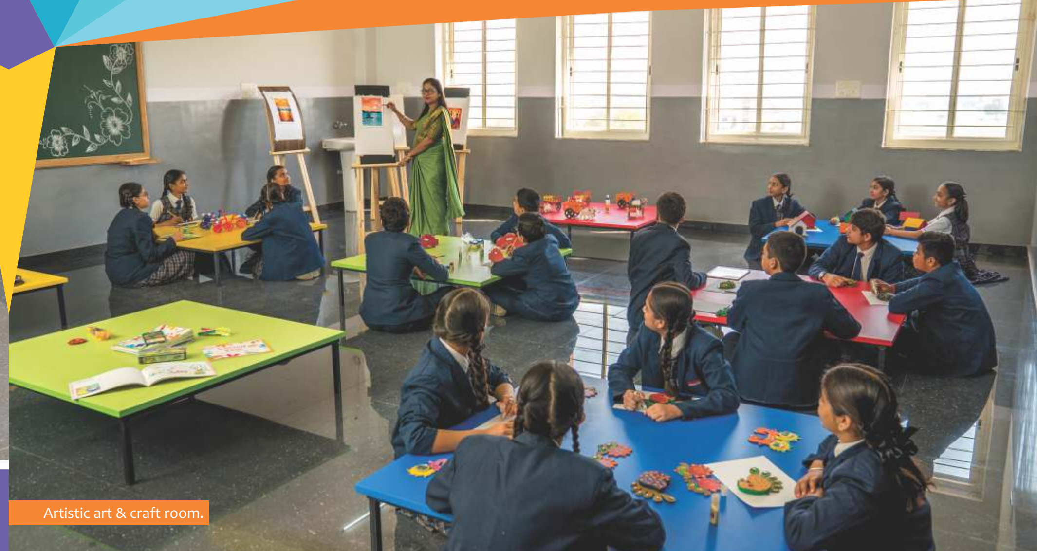
Artistic art & craft room.

Practical knowledge are an excellent way to keep young learners engaged and spark their curiosity around the topic of Science. These Critical thinking skills are vital in STEM subjects and will improve the child's overall understanding