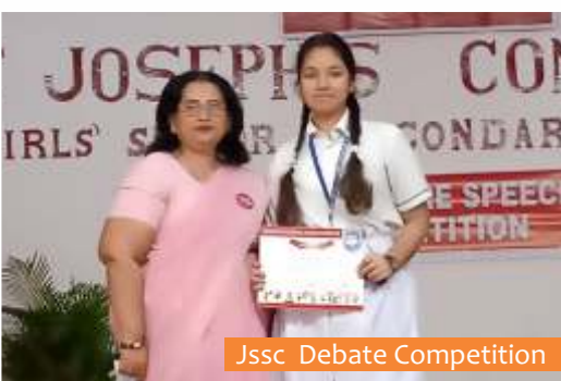
Jssc Debate Competition