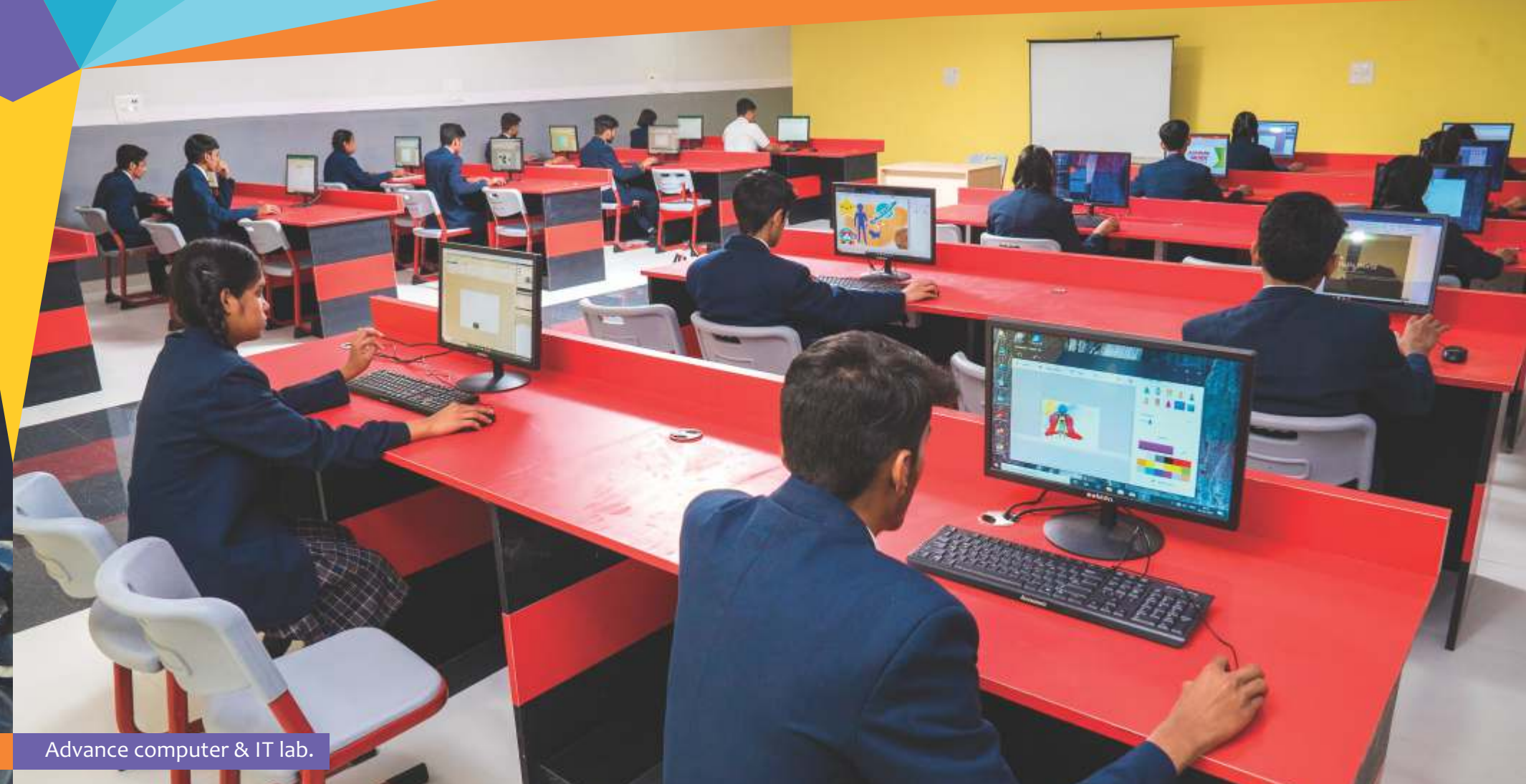
Advance computer & IT lab.