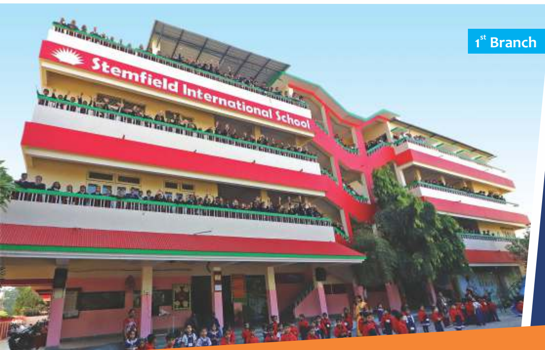
1 st Branch

"Innovating and designing the future of tomorrow"