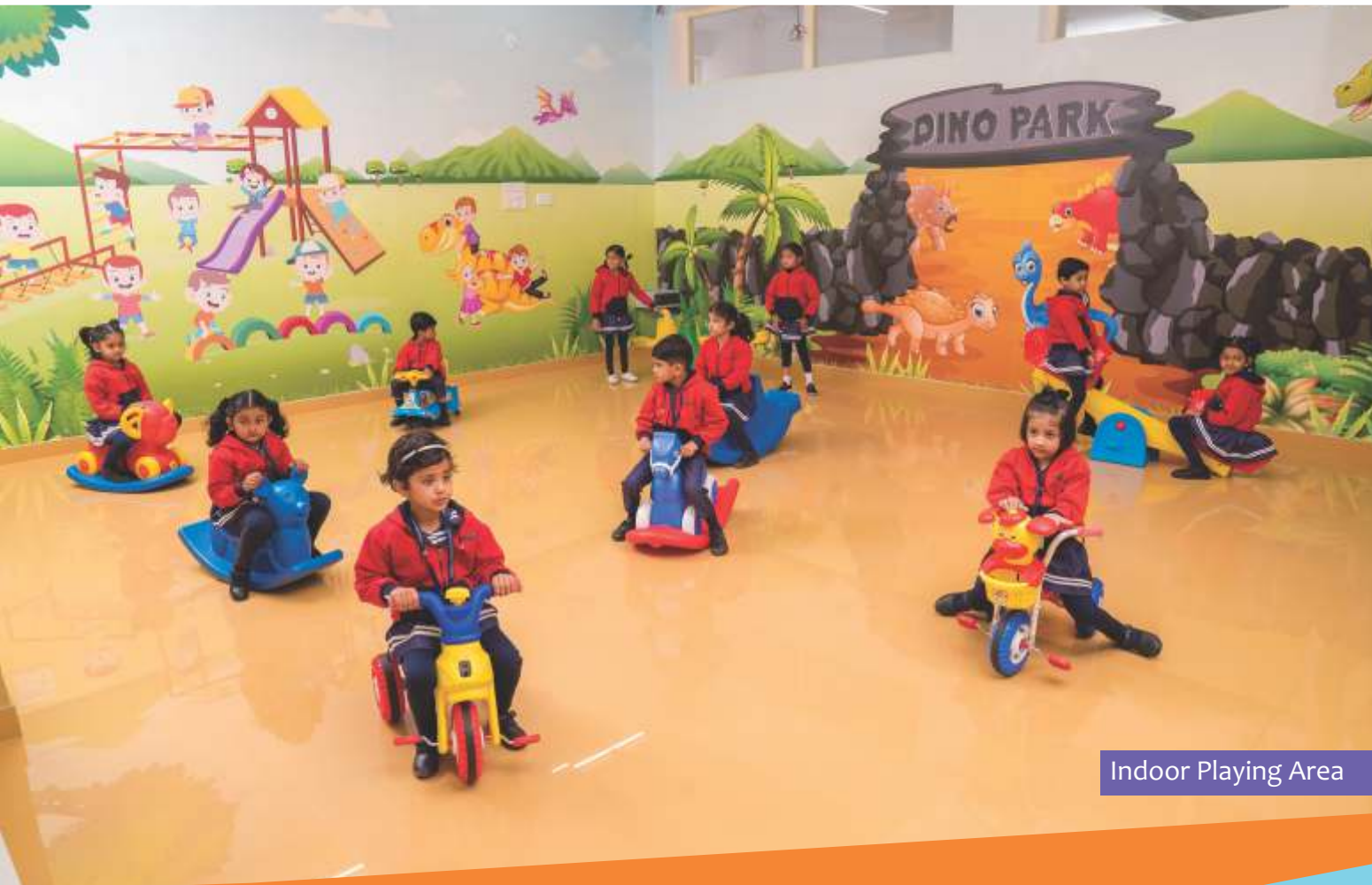
Indoor Playing Area