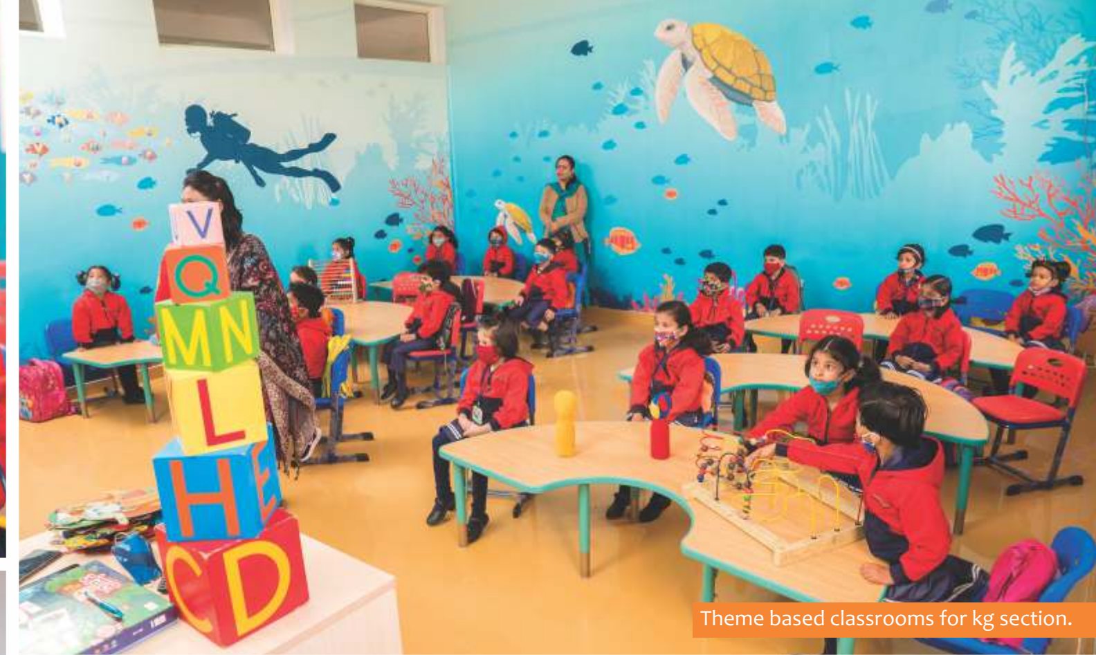
Theme based classrooms for kg section.