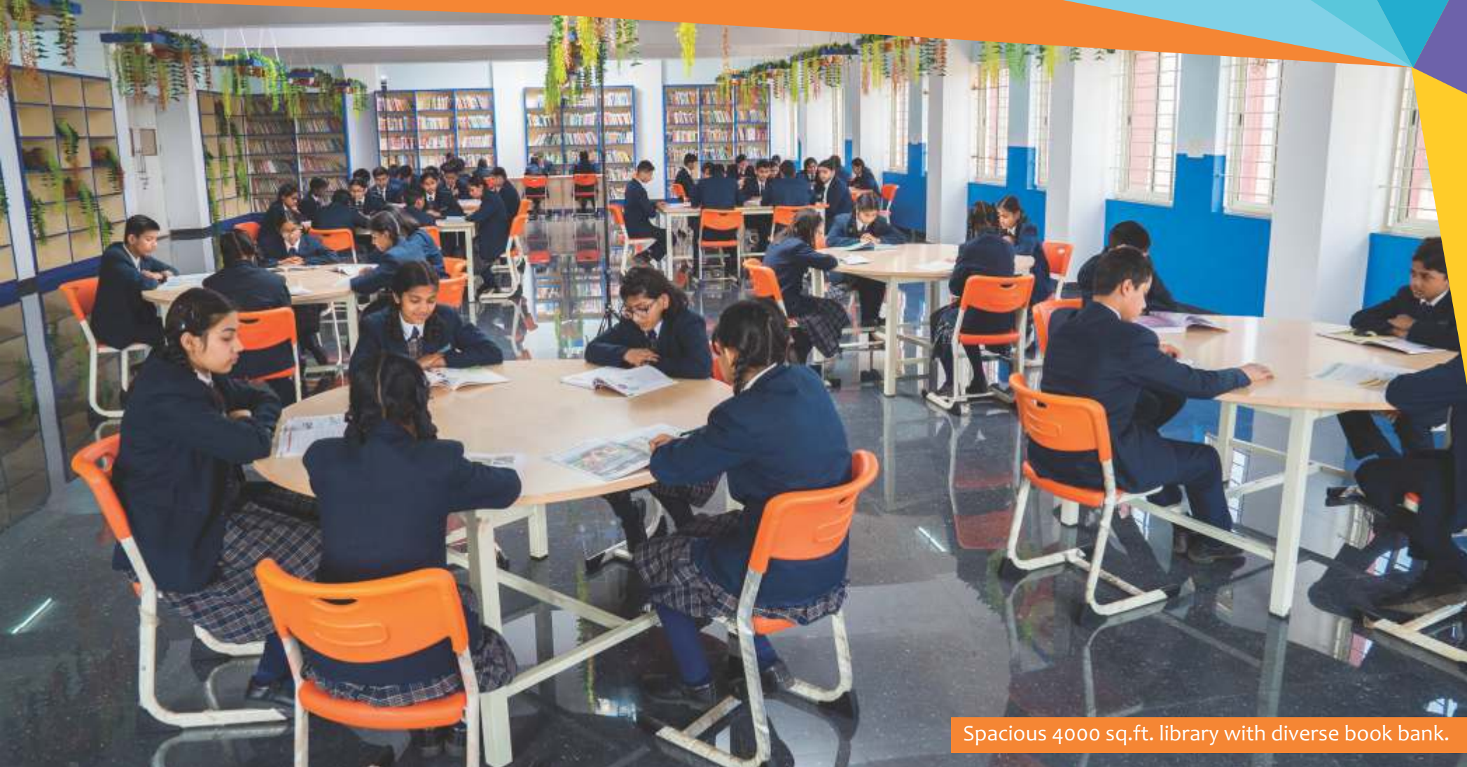
Spacious 4000 sq.ft. library with diverse book bank.